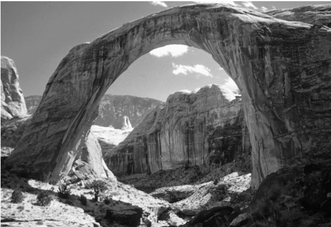
Rainbow Bridge, Utah, 1957.