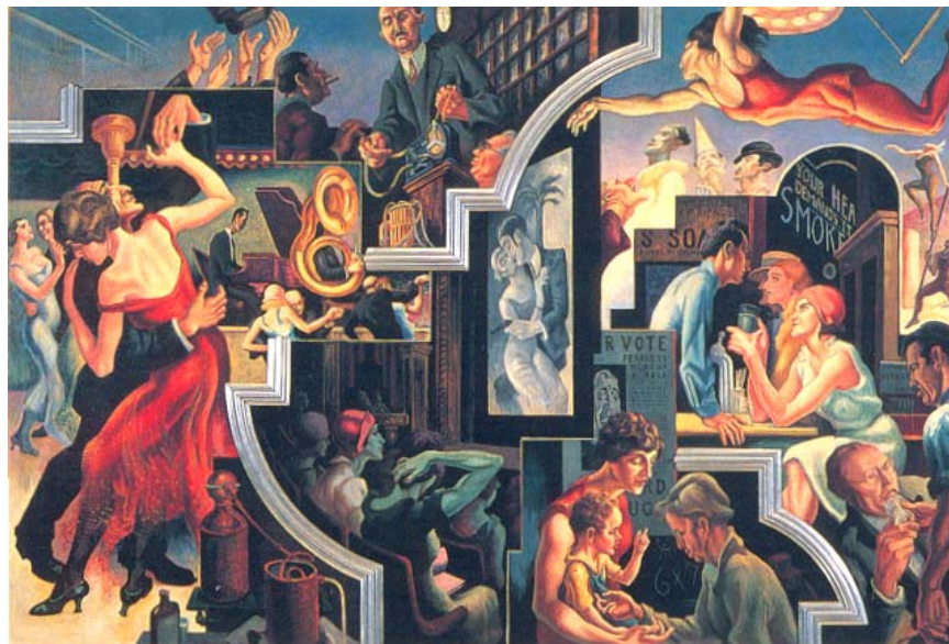
Thomas Hart Benton, "City Activities," 1930

H164.03 MWF 10:00-10:50AM AB4, 220 (Olson Auditorium) (3 credit hours)