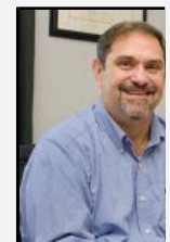
"Play"-ing with Er