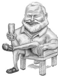
Ernest Hemingway "Papa"

Have fun and be sure to talk with me about any questions or problems.