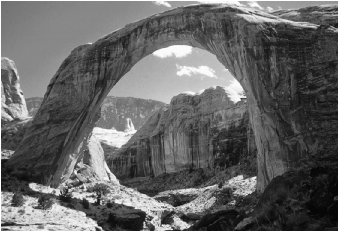
Rainbow Bridge, Utah, 1957.