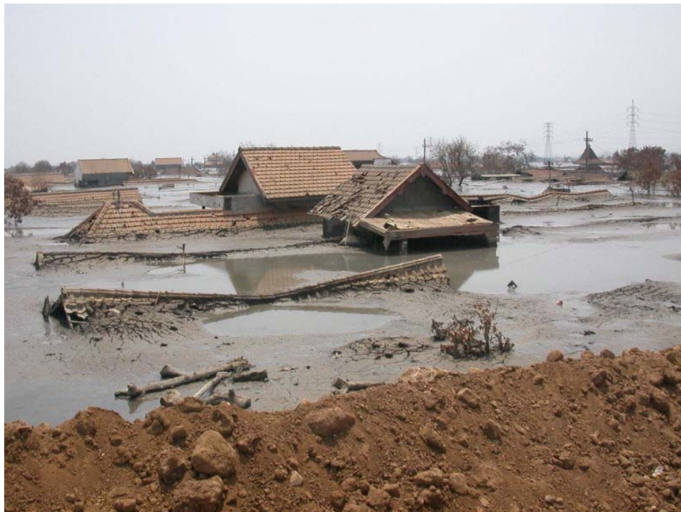
Lusi mud volcano, East Java, Indonesia