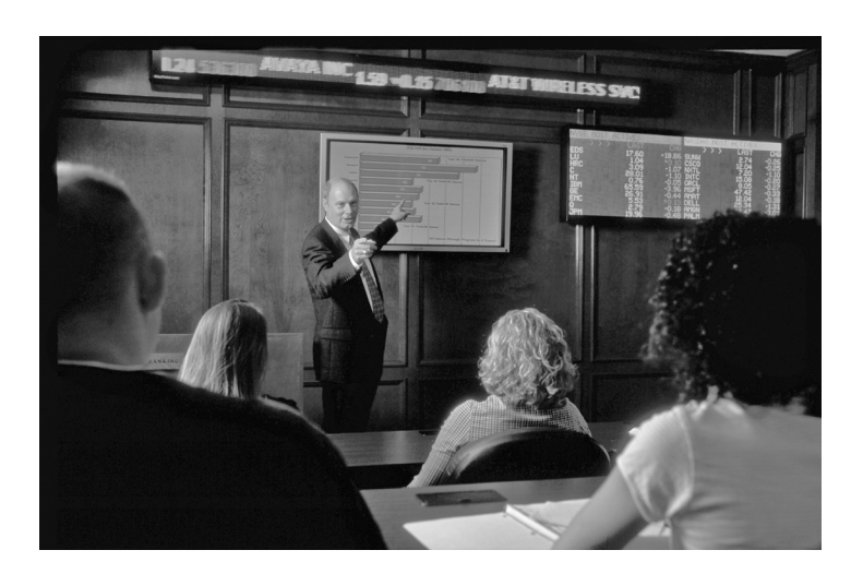
Student 9 Guidelines