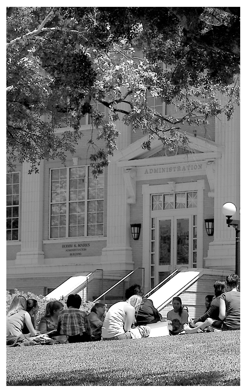
Student 20 Guidelines