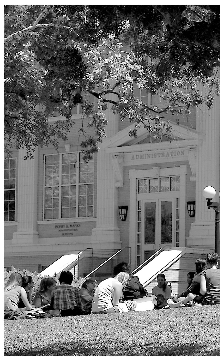
Student 20 Guidelines