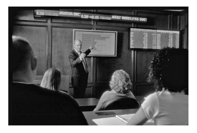
Student 9 Guidelines