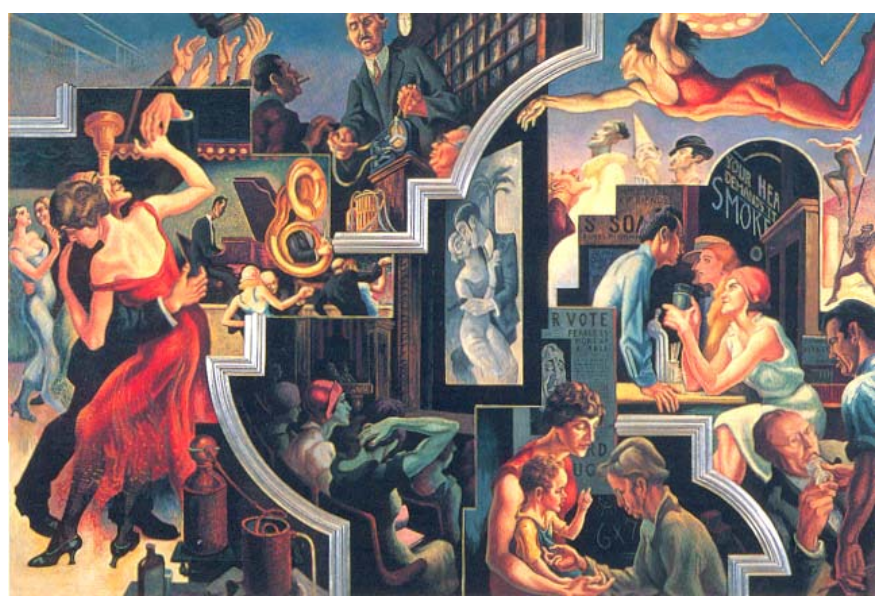
Thomas Hart Benton, "City Activities," 1930