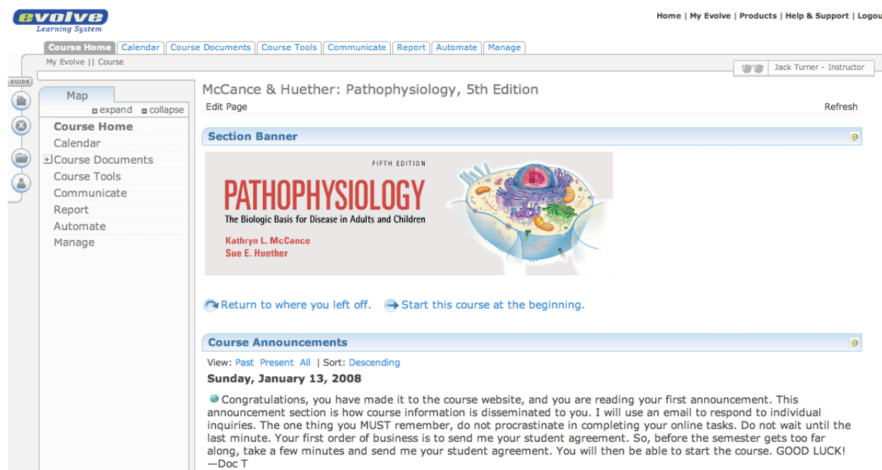
Figure 1. Once you have logged onto the Evolve website, and resolved the registration information one of the initial screens will look similar to the image above. How to get to this page is described in the original information you downloaded from the University's blackboard program under my courses, specifically BIO 346 Pathophysiology. Note the titles on the left side of the screen image. These titles are drop down menus that expose the information you will require for the course. You primarily use the Course Documents and Course Tools . The remaining titles, if they are visible on your screen, are for programs and functions we do not use. Of particular importance is the Course Announcement section. Course Announcements is how general information is disseminated to the class as a group. Individual emails will respond to individual inquiries. Be sure to check your Course Announcements and your email daily. If you have not checked you announcements in several days, be sure when you do check that you have not missed an announcement. The easiest way is to highlight the selection "All" where "View" is selected. The most recent announcement will be the first in your list of announcements.

The Evolve website is divided into a series of compartments, navigated by drop down menus on the left side of the course home page (Fig. 1). There are really only two of these menus for you to use. The other menus (if they are visible on your screen) are used by other programs in different courses.