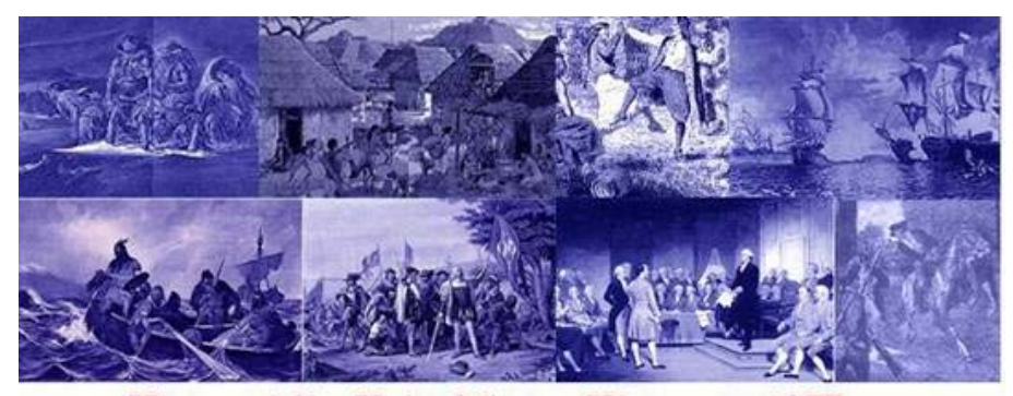
History 163: United States History to 1877