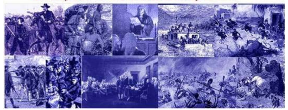
COURSE SYLLABUS HISTORY 163.09 (CID: 4479)-----WF 3:00-3:20 PM----LDB 207 (3 credit hours)