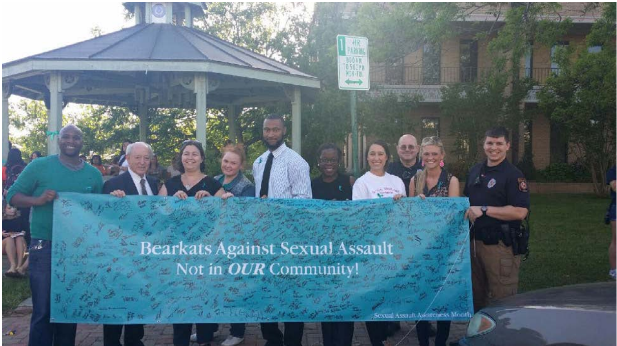
2013 3 rd Annual “Ignite the Night” Program, a community collaborative effort

Officers discuss topics about prevention and intervention of sexual assault and domestic violence. Learn about how to recognize the signs of violence, what to do if you or a person you know is a victim, and how to intervene. Groups will receive information pertaining to Texas state laws, statistics, prevention, and awareness tips.