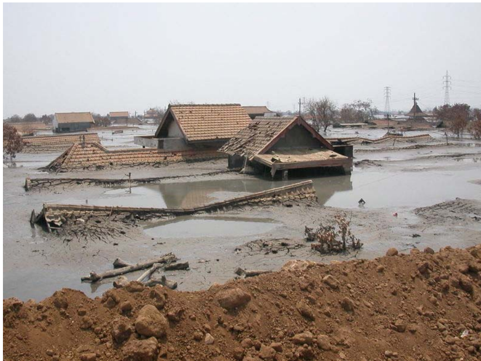
Lusi mud volcano, East Java, Indonesia