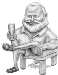
Ernest Hemingway "Papa"